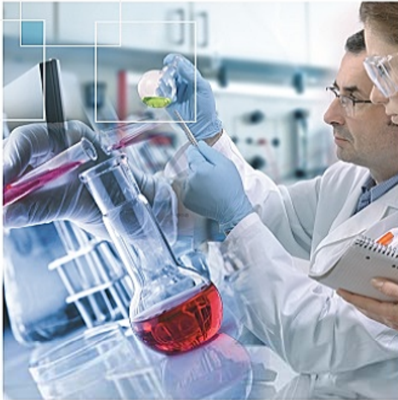
[WETCO solves all your water analysis needs]

WETCO Testing Laboratory facilitates its clients with all the water testing with the most sophisticated equipment at our laboratory in Lahore. We have proven expertise in the full range of cooling water, boiler, reverse osmosis, waste water & canal clarification quality testing.